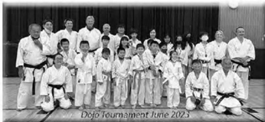
Dojo Tournament June 2023

We are proud to support Akimatsuri Golf Tournament